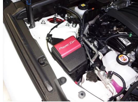
LEXUS NX350 installation example