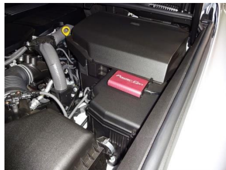
LX600 Installation Example