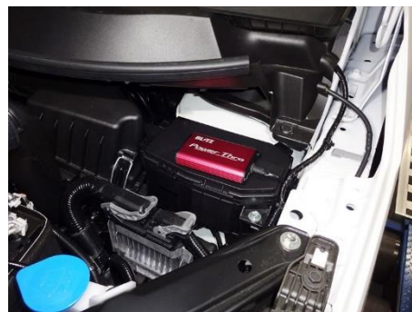
STEP WGN Installation Example