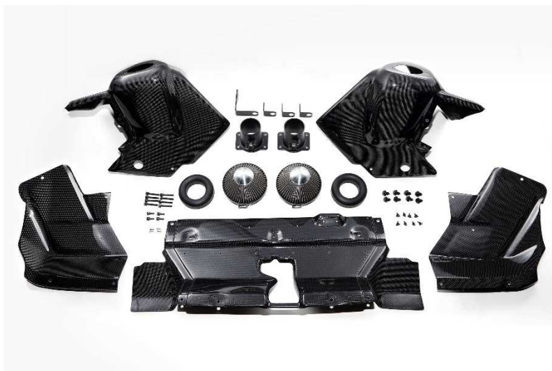
CARBON INTAKE SYSTEM