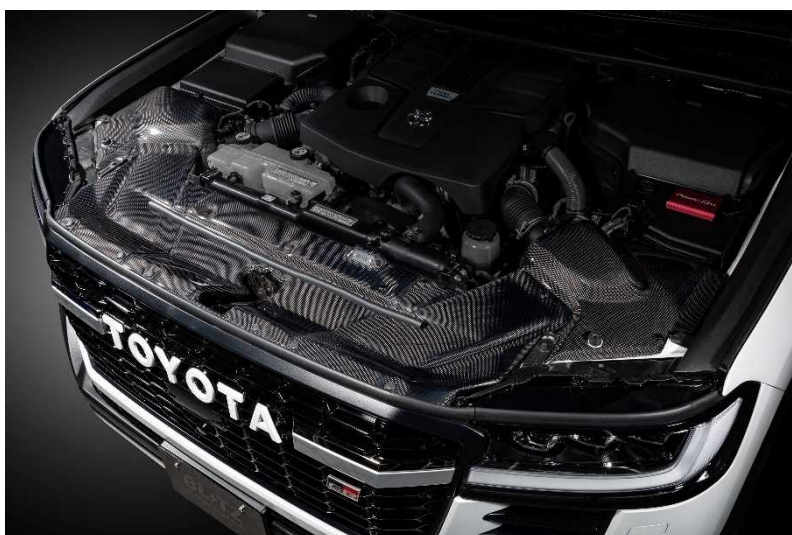
TOYOTA LAND CRUISER (VJA300W)

Click here for further information on CARBON INTAKE SYSTEM