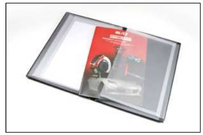
30mm A5 Size Pocket