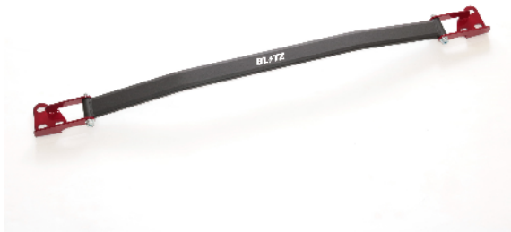
Fairlady Z Front