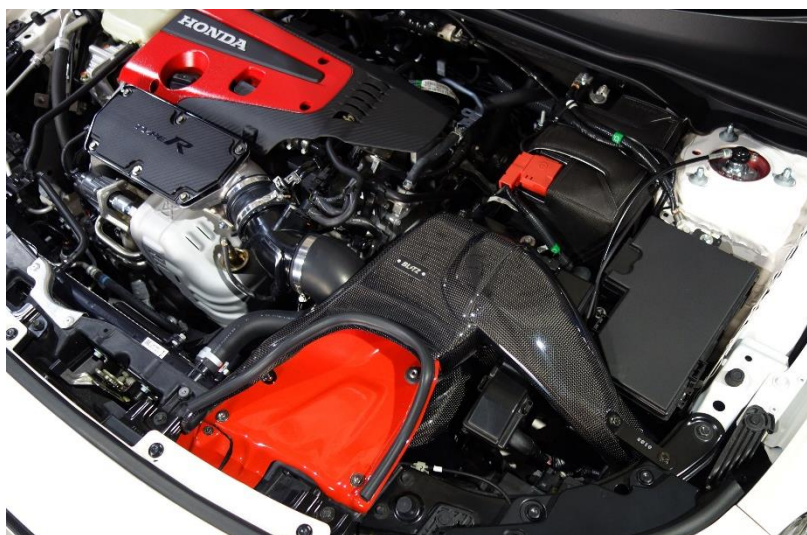
HONDA CIVIC TYPE R (FL5)

Click here for further information on CARBON INTAKE SYSTEM