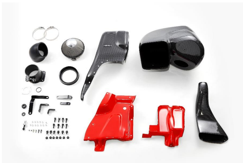
CARBON INTAKE SYSTEM