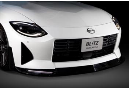
Front Lip Spoiler / Bumper Garnish Arch Diffuser