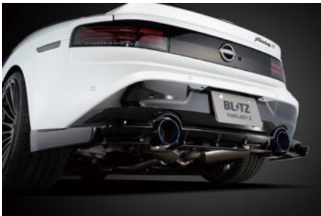
Rear Side Spoiler / Under Spoiler NUR Fit Sold Separately