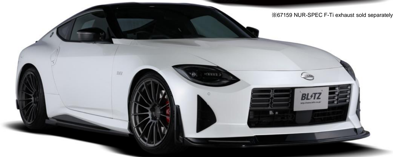
BLITZ FAIRLADY Z RZ34 ※FRP parts painted in example.

※67159 NUR-SPEC F-Ti exhaust sold separately