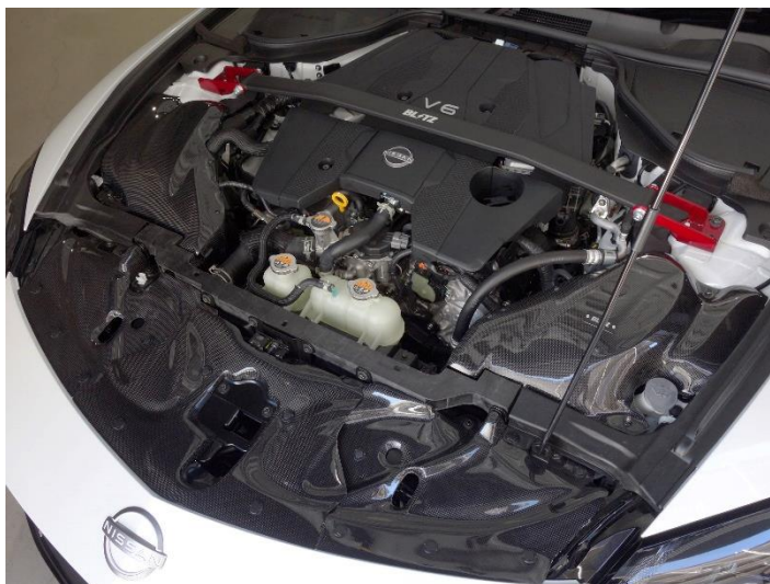
NISSAN FAIRLADY Z (RZ34) Installation Example

Click here for further information on CARBON INTAKE SYSTEM