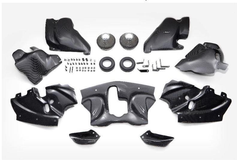
CARBON INTAKE SYSTEM