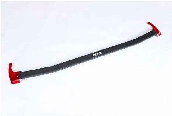
Toyota Aqua MXP16 Front