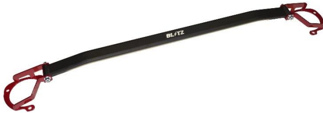
Toyota GR86 ZN8 Front