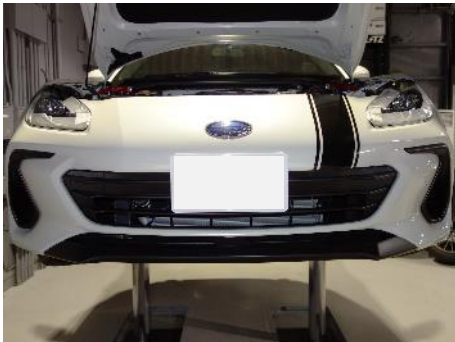
BRZ(ZD8) Installation Example