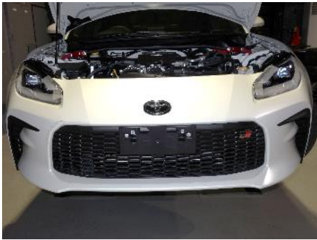
GR86(ZN8) Installation Example