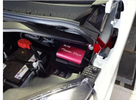
HONDA N-BOX Installation Example