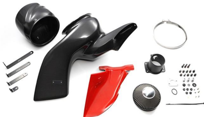
TOYOTA GR COROLLA (GZEA14H) CARBON INTAKE SYSTEM