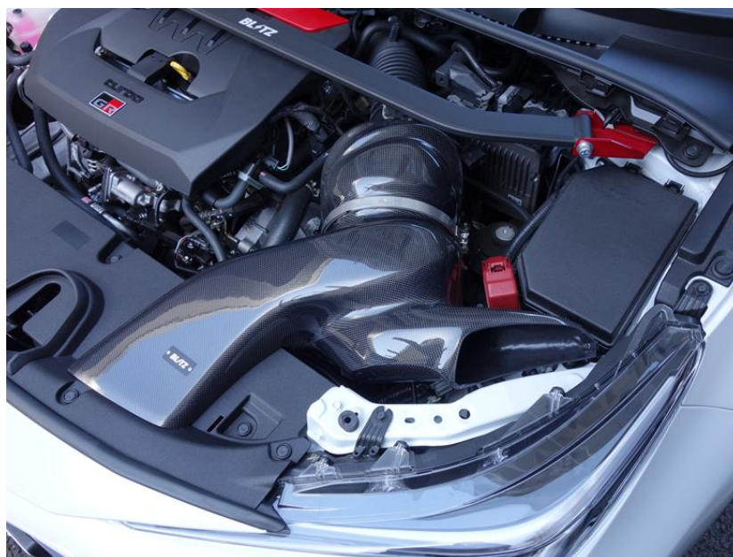
TOYOTA GR COROLLA (GZEA14H) Installation Example

Click here for further information on CARBON INTAKE SYSTEM