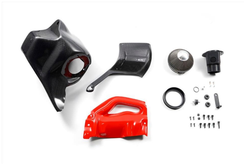
CIVIC RS(FL1) CARBON INTAKE SYSTEM