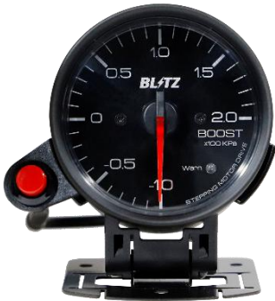
Installed with Meter Holder